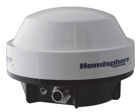
Figure 1-1: A325 smart antenna

Note: Throughout the rest of this manual, the A325 Smart Antenna is referred to simply as the A325.